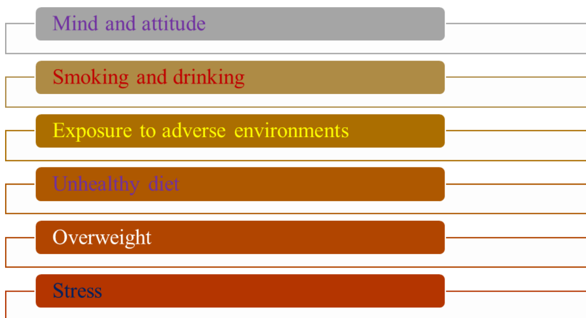
Fig 2: Factors of premature ageing

No increase in life span of F344 rats occurred with the level of dietary restriction (DR). Low level of DR affected the life span. Rodent study done by Richardson A1,2, Austad SN et al., 2016., gave implications suggesting that a modest reduction in calories would show health benefits in humans (21) . Extension of life-span due to reduced vitellogenesis and enhanced lysosomal lipolysis needed nuclear hormone receptors (NHRs) NHR-49 and NHR-80. This suggested some novel roles for these NHRs in lysosomal lipid signaling. Dietary-restricted worms and mice showed a decrease in the expression of VIT (vitellogenin) and hepatic APOB (apolipoprotein B), respectively, indicating a conserved longevity mechanism (22) . Limitation of specific amino acid, methionine imitated the effects of DR with extension of life span among experimental organisms. Beneficial effect of methionine-restricted diet, the molecular pathways involved in longevity promoting interventions was revealed (23) .