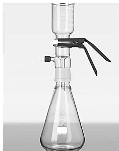
Fig. 1: Membrane filter unit (Duran)

Filtration: Filtration trials was done using 25ml of liquid well grown L. interrogans serovar Grippityphosa , with several filters mounted in a filter holder with a vacuum of 5 inches of Hg to draw the sample in the bottom flask (Fig. 1). The entire filtration unit was autoclaved before initiating the procedure. Initially all the filters are analyzed for its efficiency by filtering the sterile phosphate buffered saline (PBS) solution.